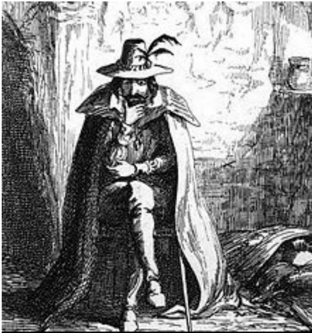
George Cruikshank's illustration of Guy Fawkes, published in William Harrison Ainsworth's 1840